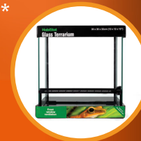
Glass Terrarium 30 x 30 x 32cm