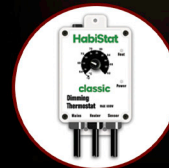
Dimming Thermostat 600W