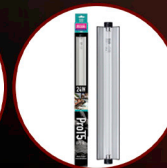
Pro T5 UVB Kit 6% UVB, 24W