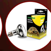
Basking Spotlamp 100W