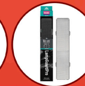
Lamp Guard Pro