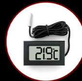
Digital Compact Thermometer