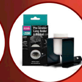
Ceramic Lamp Holder Plus Bracket Pro