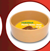
Round Plastic Water Bowl