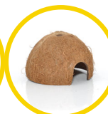
Coconut Cave x 2