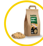
Leopard Gecko Bedding 5 kg