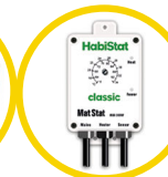
Mat Stat 300 Watt