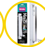
Mini UVB Kit, 7%UVB ShadeDweller Lamp, 8W