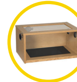
Terrarium 61 x 38 x 30cm (24 x 15 x 12")