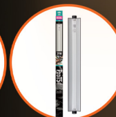
Pro T5 UVB Kit, Desert, 12% UVB, 39W