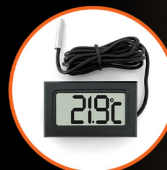
Digital Compact Thermometers x 2