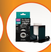
Pro Ceramic Lampholder and Bracket