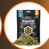
Earth Pro Dragon Fuel