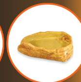
Sandstone Water Dish