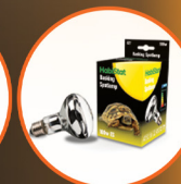
Basking Spotlamp 100W