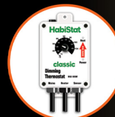
Dimming Thermostat, High Range, 600W